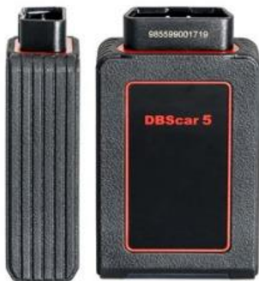
2018 Launch X431 DBScar 5